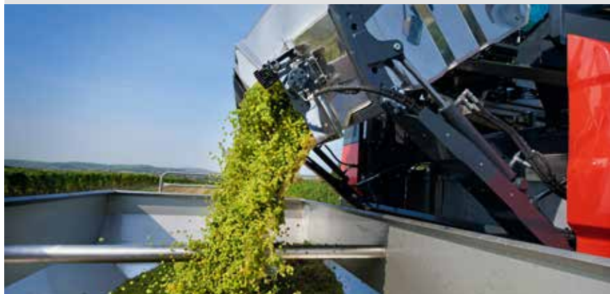
Lateral offloading enables faster grape bin emptying and perfect view to the bin and trailer.