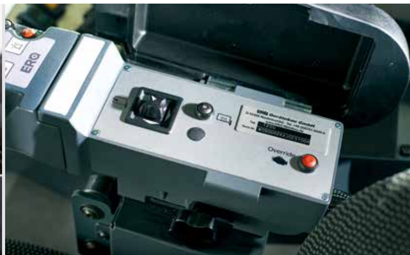
Ergonomic proportional joystick and improved arm rest design