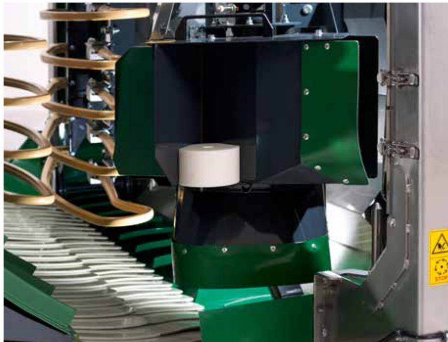
Electric lift for easy access and proper cleaning.