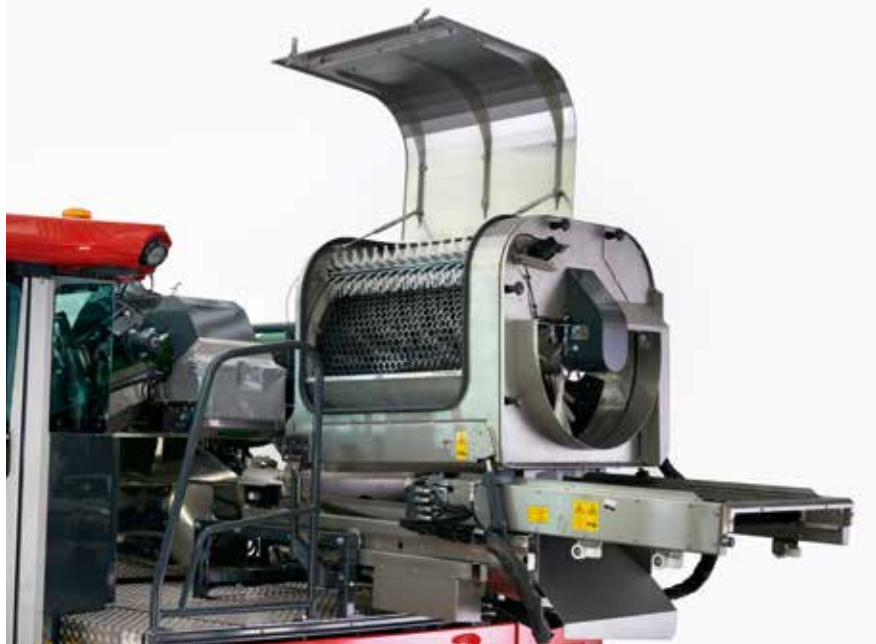
Reduced wash-down time by closing the access to the destemmer, when not using it.