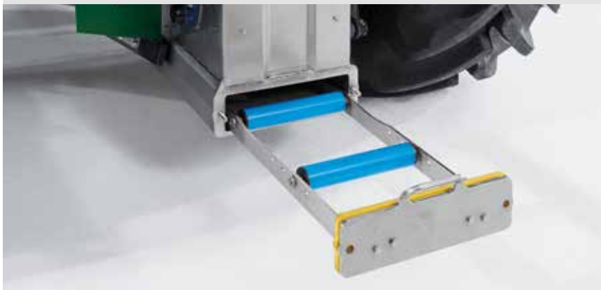
The roller track underneath the conveyor belt reduces belt friction and wear. It can be easily pulled out for cleaning.