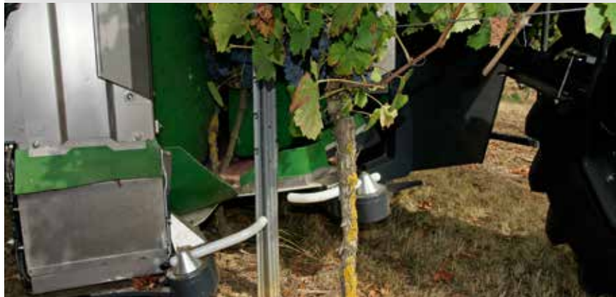
The Automatic Steering System (option) allows the operator to focus on the fruit process in order to get the cleanest sample.