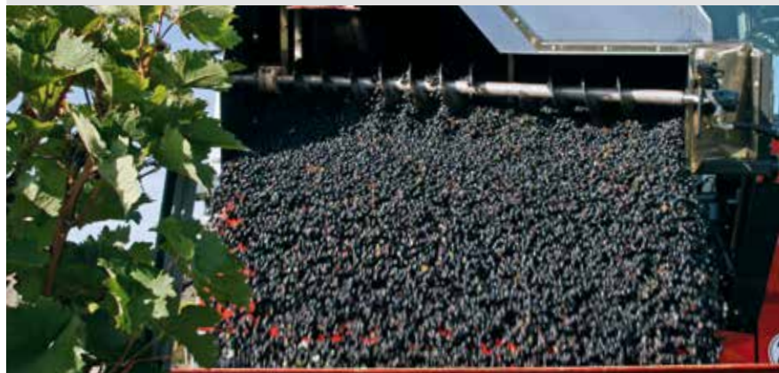
Just like a hand-picked sample.