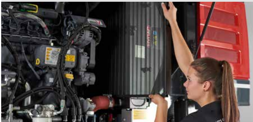
Simplified daily checks