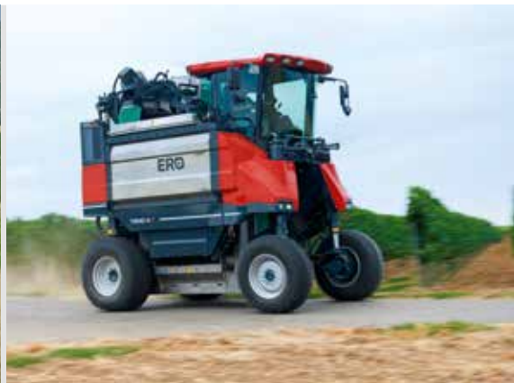
40 km/h Comfort Package: short repositioning times at maximum driving comfort.