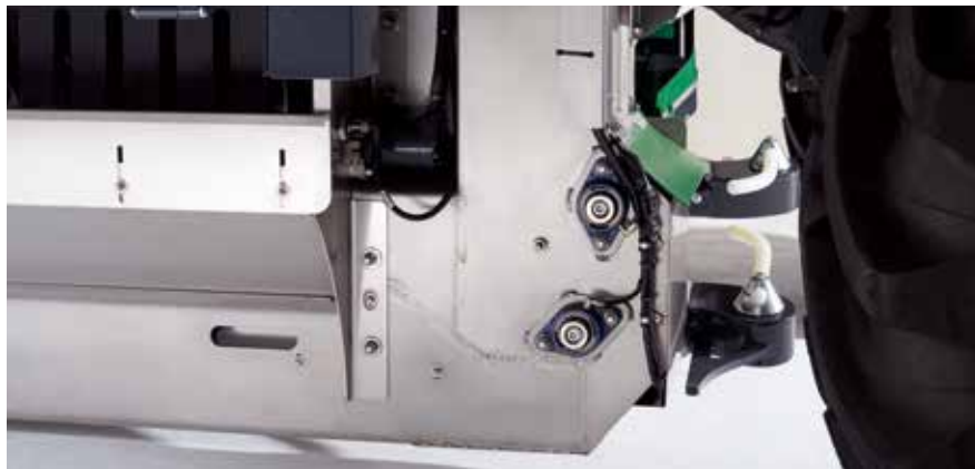
Extending the grape channel by two additional slats reduces losses of picked grapes to a minimum.