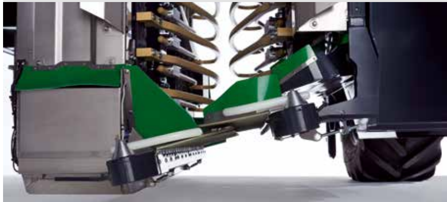
Single sided conveyor system; Cross wind towards the right-hand side of the machine; Angle adjustment of both scale tracks for optimum material flow.