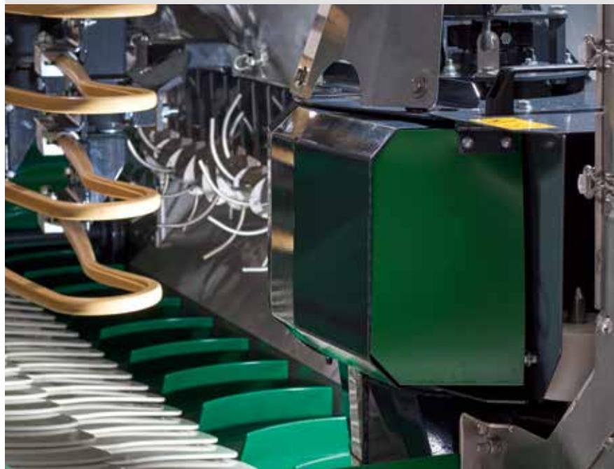
Improved lower suction fan with flexible cover.