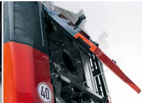
The lightweight row wipers (left) can be easily and quickly removed and reinstalled for maintenance and cleaning.