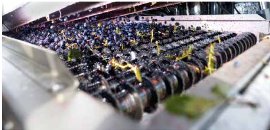
Hydraulically adjustable roller spacing from the driver's seat.